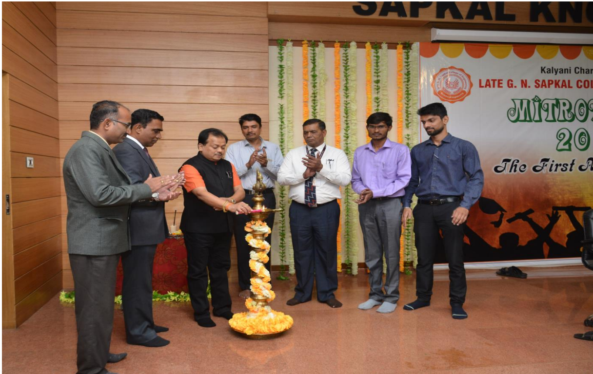
Lightening the Lamp