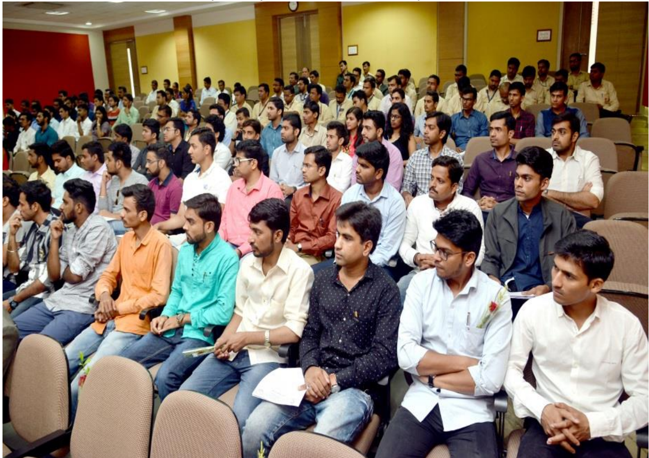
Audience & former student