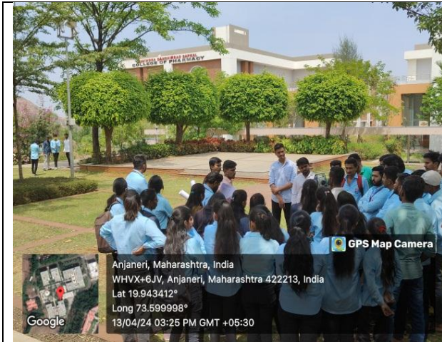
Students while measuring Distance and finding measurement errors