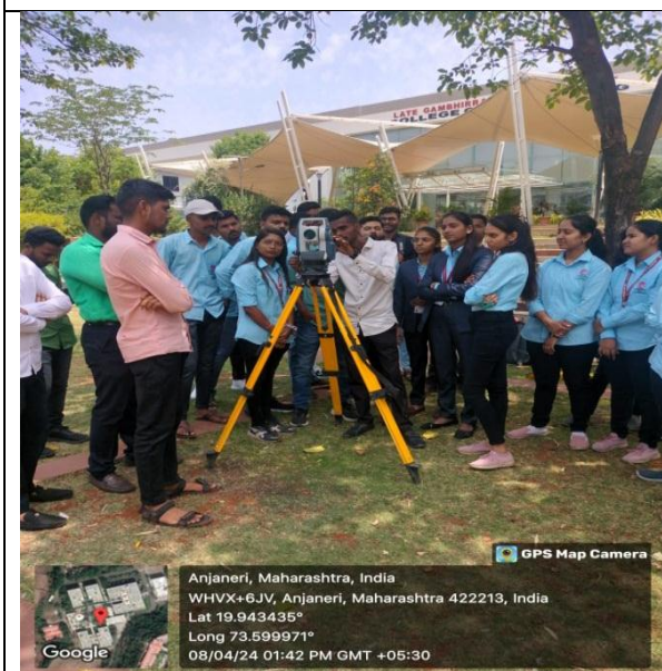
Expert while teaching topographic survey methods and data collection to students