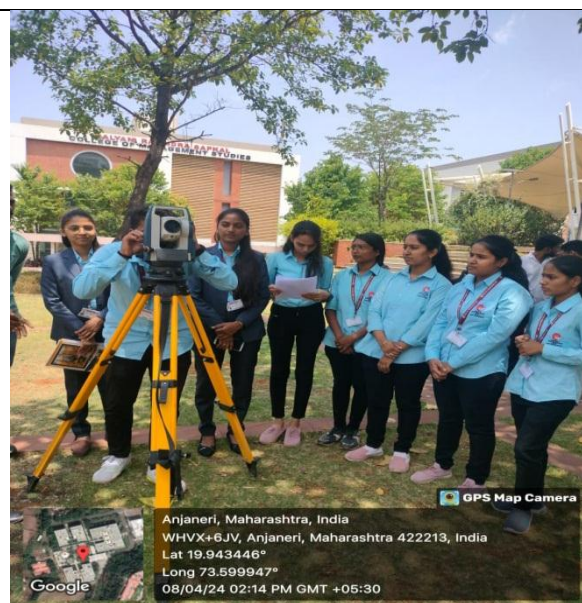
Students while preparing maps using coordinates and interpretation of data