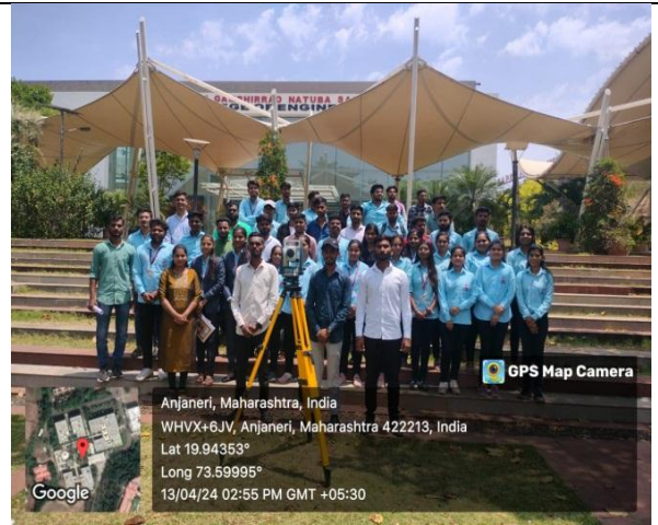
Participants students with Trainer